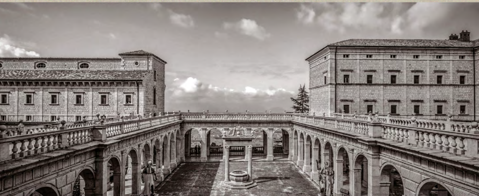
ABBAZIA DI MONTECASSINO